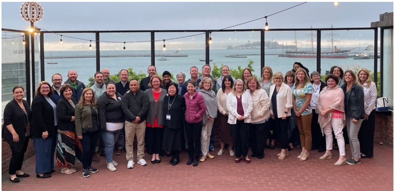
School leaders from both the East West and Ohio Province ministries gathered in San Francisco, CA for the annual School Leaders Conference.