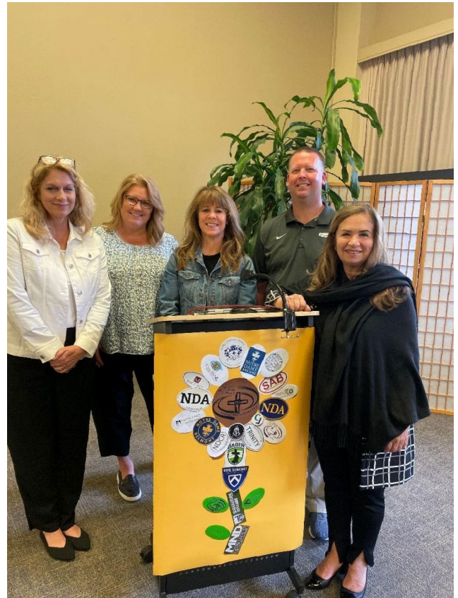
Leadership from Academy of Notre Dame in Tyngsboro, MA.