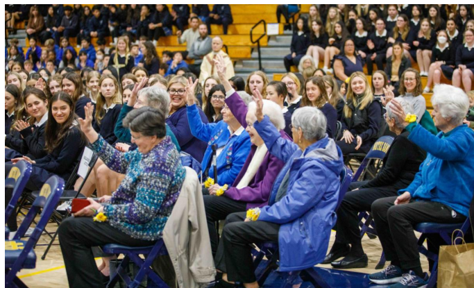
Notre Dame Elementary and High School, Belmont, CA celebrating Founders' Day Mass together