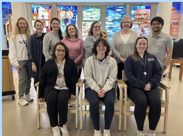
Pictured: SNDdeN Hallmarks Retreat Participants.