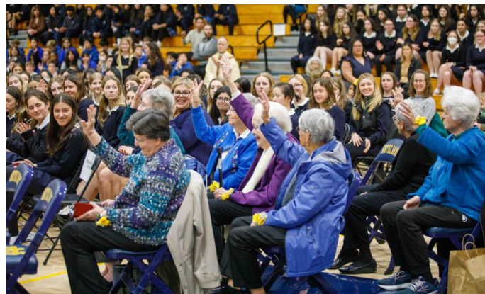
Notre Dame Elementary and High School, Belmont, CA celebrating Founders' Day Mass together